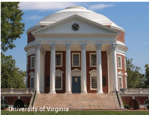
University of Virginia

Students have access to flexible programming options, online and hybrid delivery, with intensives held on-campus in Bluefield and at NCI.